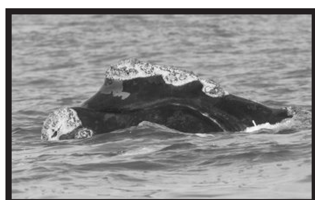
White Marking on Head