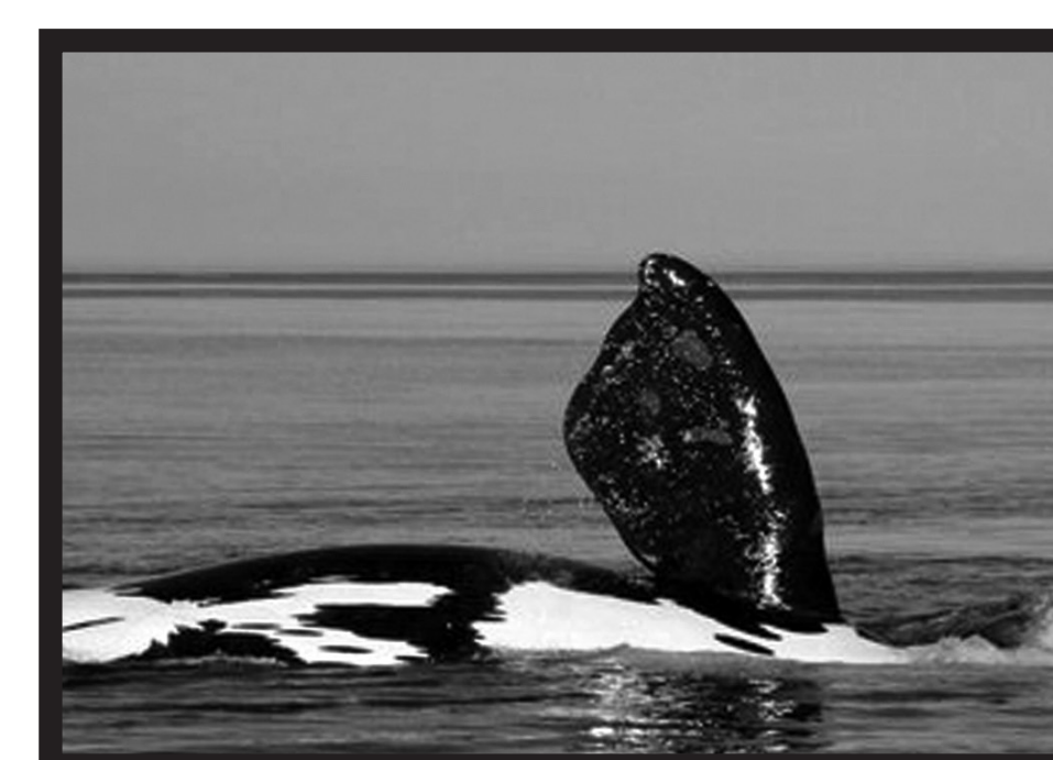
Paddle Shaped Flippers