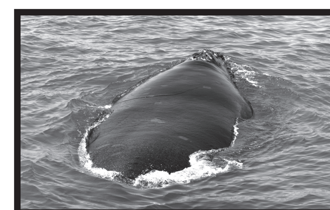
No Dorsal Fin