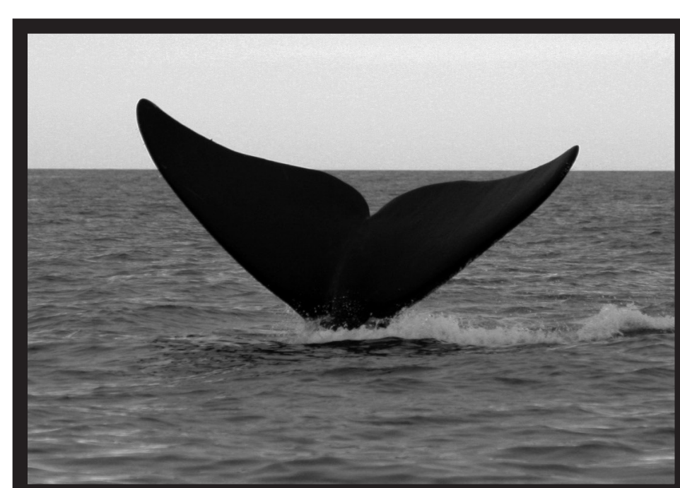
All Black, Smooth Tail