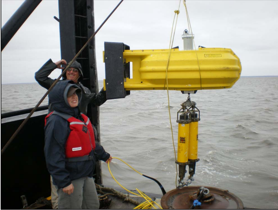
Figure 1 – ‘Jumbo EAR’ with submarine structure and acoustic releases