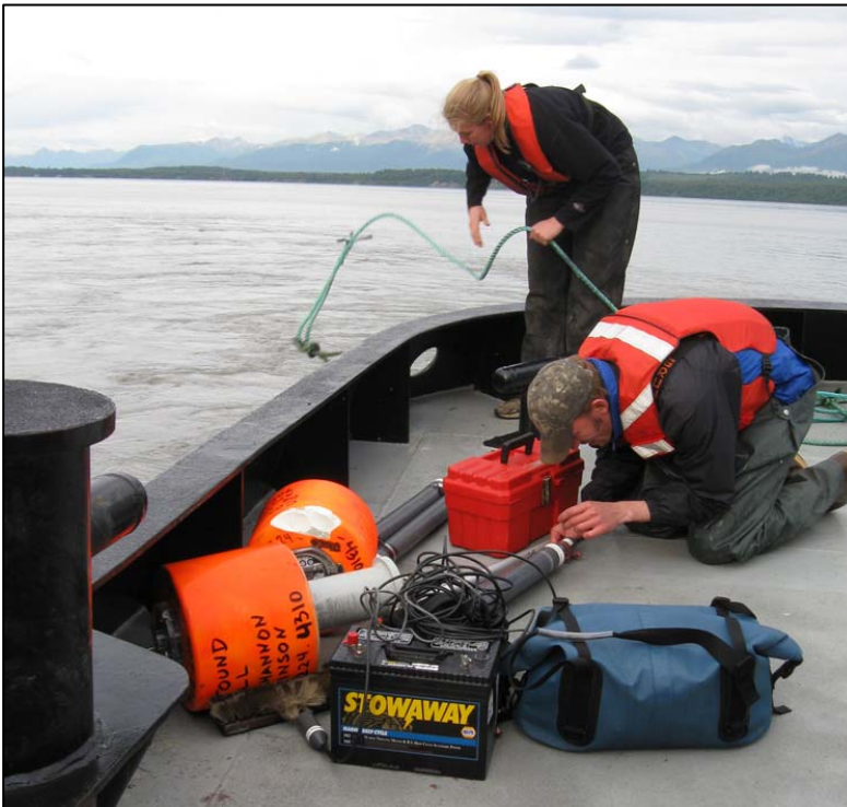
Figure 2 – Conventional EARs with syntactic foam float and acoustic releases