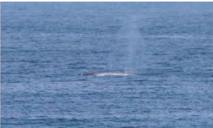
Figure 13. Blue whales observed on 2021-08-01 (VD106).