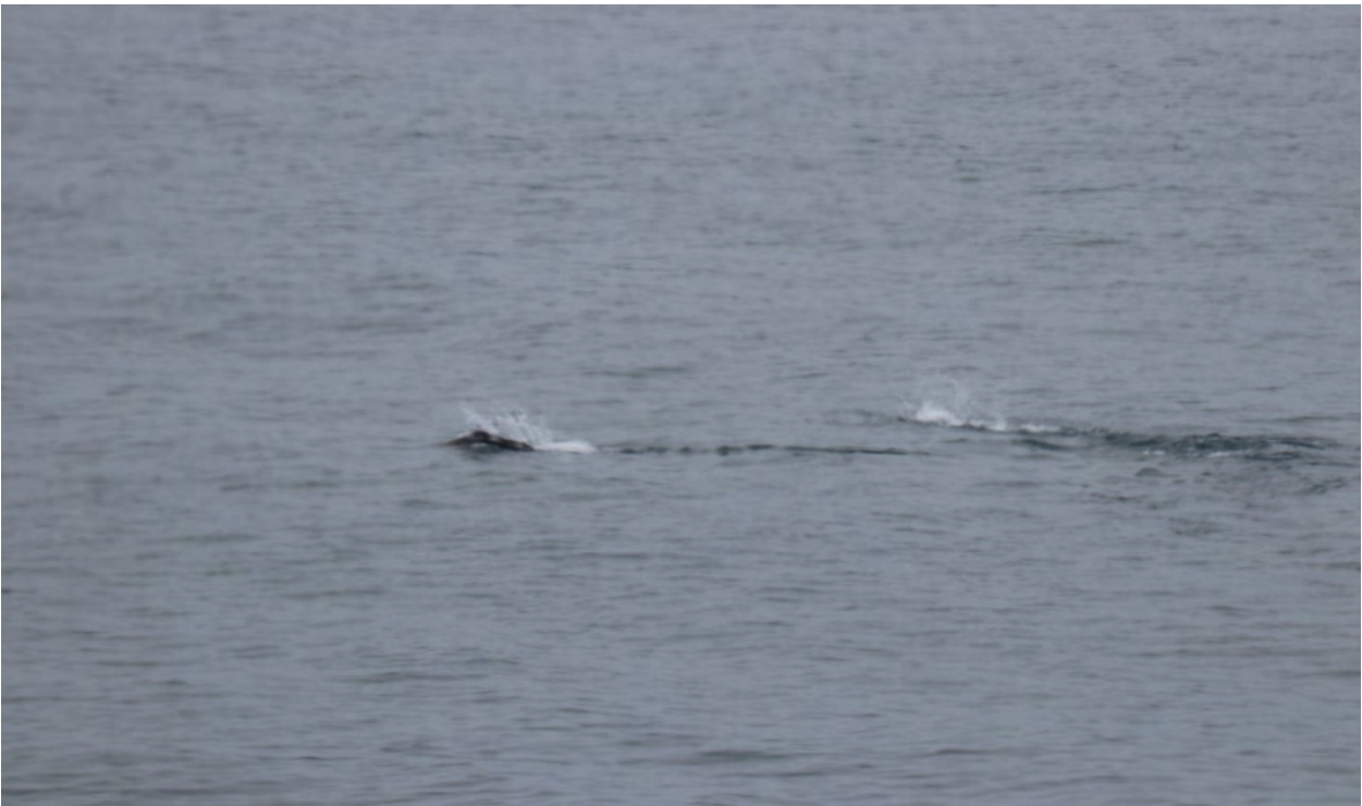
Figure 7: Dall's Porpoise- Visual Detection #87