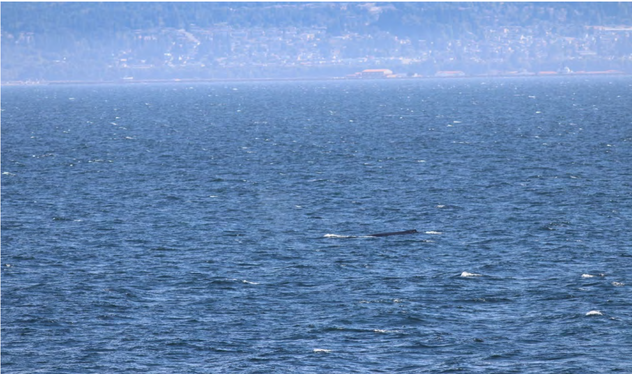
Figure 1: Humpback Whale- Visual Detection # 03