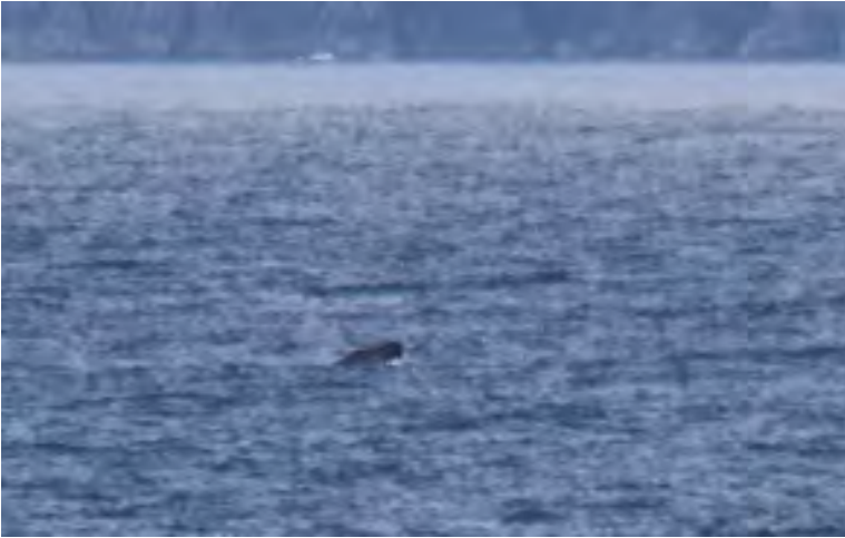
Figure 24. Humpback whale observed on 2021-08-07 (VD130).