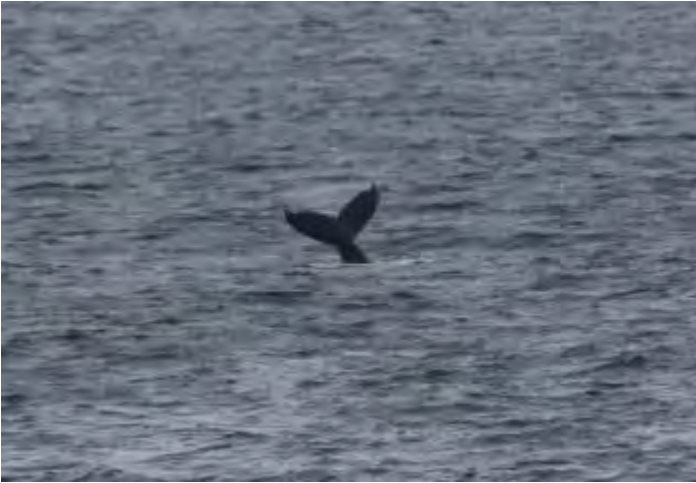
Figure 17: Humpback Whale- Visual Detection # 119