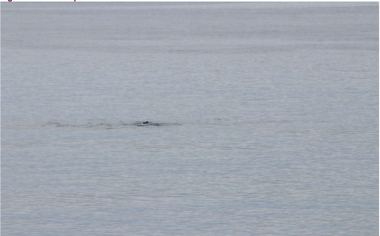
Figure 8: Dall's Porpoise- Visual Detection #89