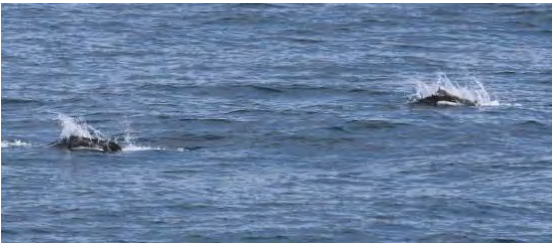
Figure 12. Dall's porpoises observed on 2021-08-01 (VD105).