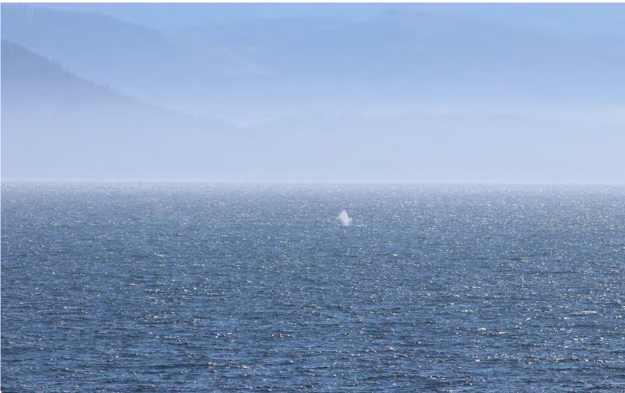
Figure 2: Humpback Whale-Visual Detection #04