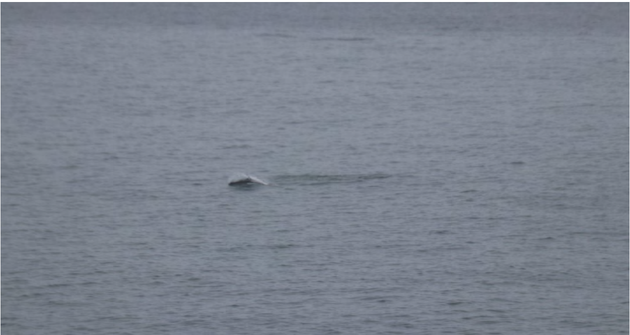
Figure 9: Dall's Porpoise- Visual Detection # 92