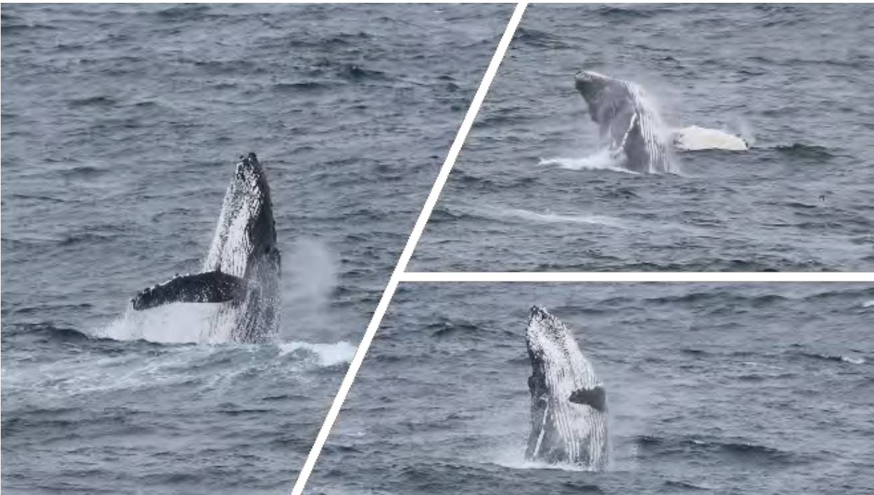
Figure 19: Humpback Whale-Visual Detection #121