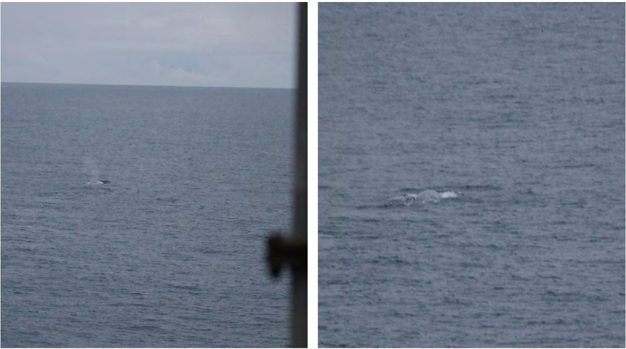
Figure 11: Fin Whale- Visual Detection #104