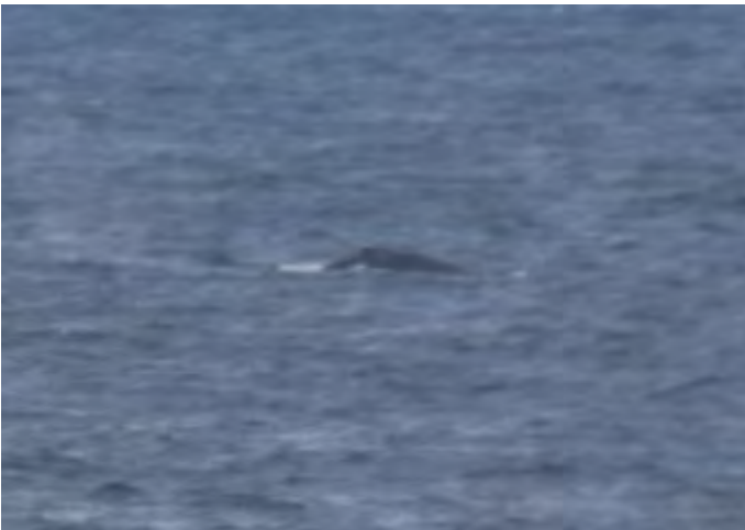
Figure 23:Humpback Whale-Visual Detection #129