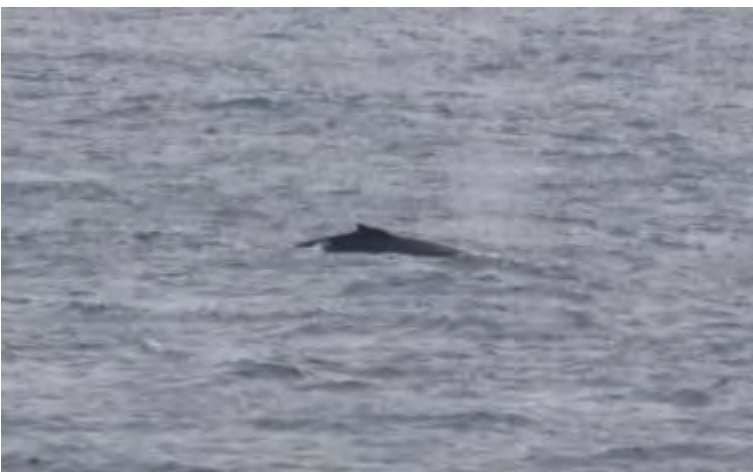
Figure 25. Humpback whale observed on 2021-08-07 (VD131)