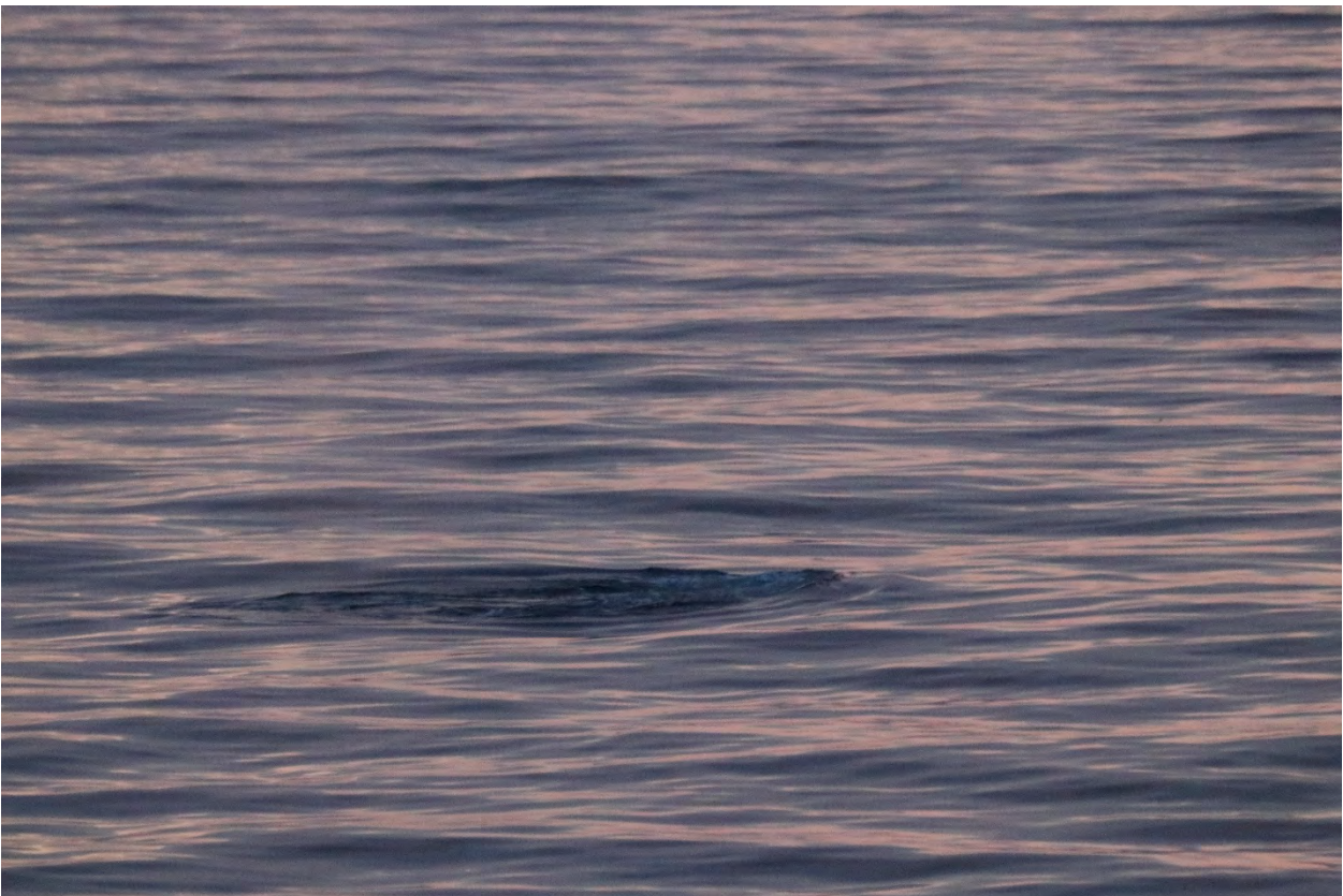
Figure 6: Minke Whale- Visual Detection #84