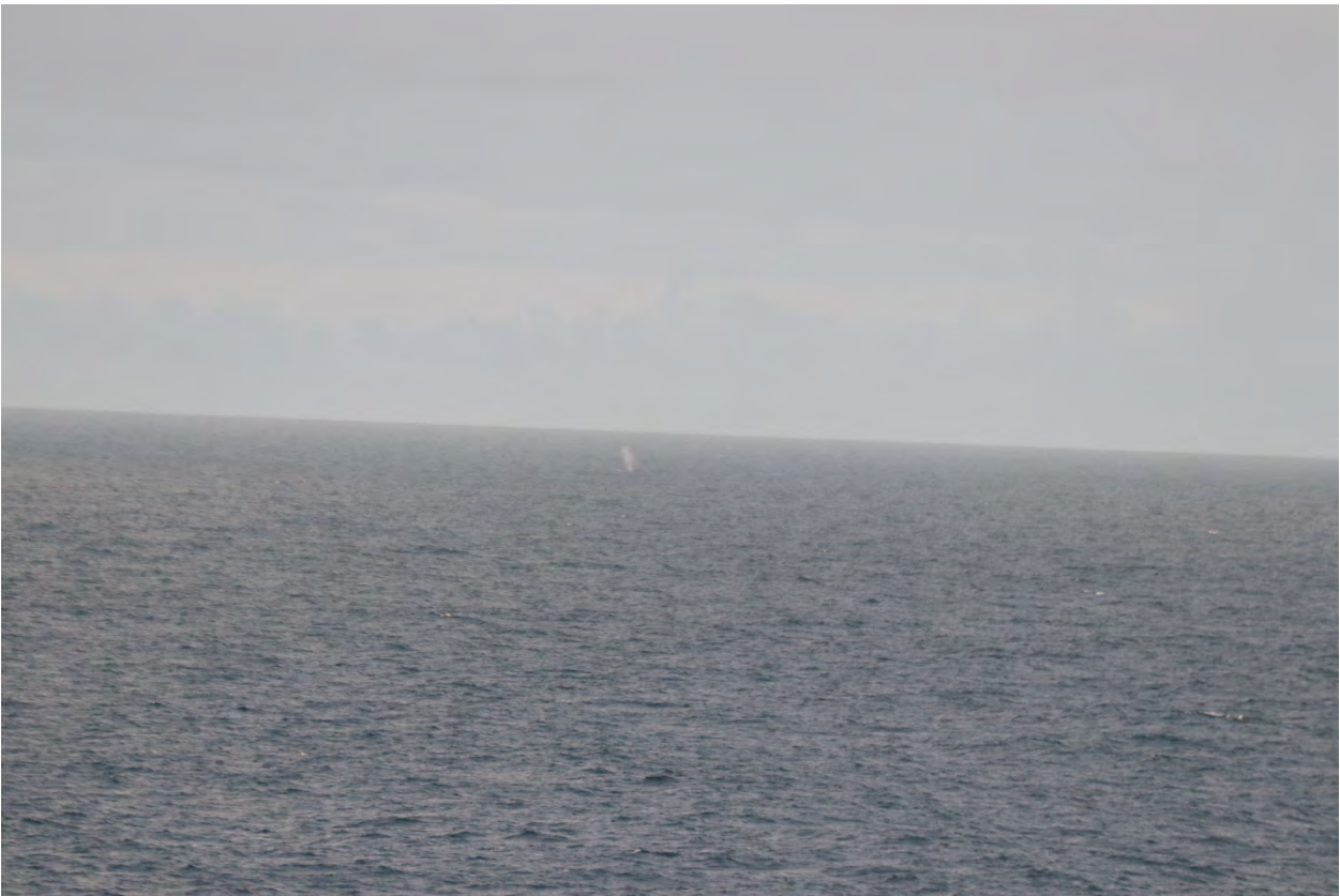
Figure 5: North Pacific Right Whale- Visual Detection # 72