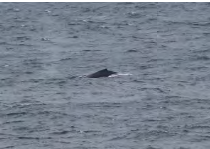
Figure 18: Humpback Whale-Visual Detection #120