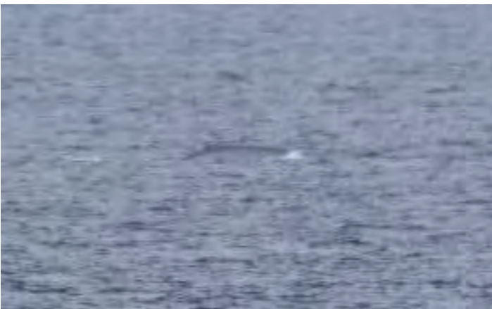
Figure 16: Blue Whale-Visual Detection #115