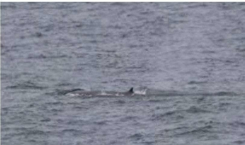
Figure 15: Fin Whale-Visual Detection #113