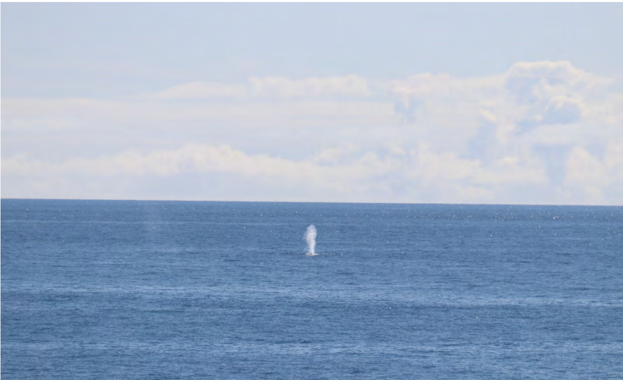
Figure 14: Blue Whale- Visual Detection # 107