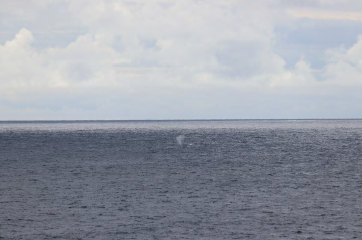
Figure 22: Fin Whale- Visual Detection # 128