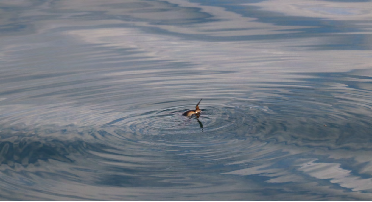
Figure 3: California Sea Lion- Visual Detection # 13