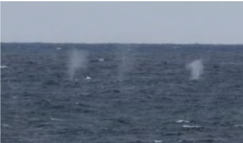
Figure 20: Humpback Whale-Visual Detection # 122