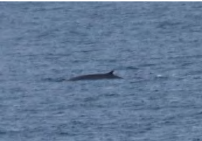
Figure 10: Fin Whale-Visual Detection #103