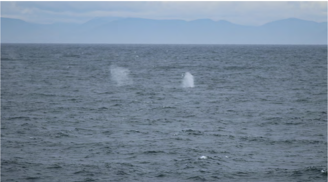
Figure 4: Sei Whale-Visual Detection #55