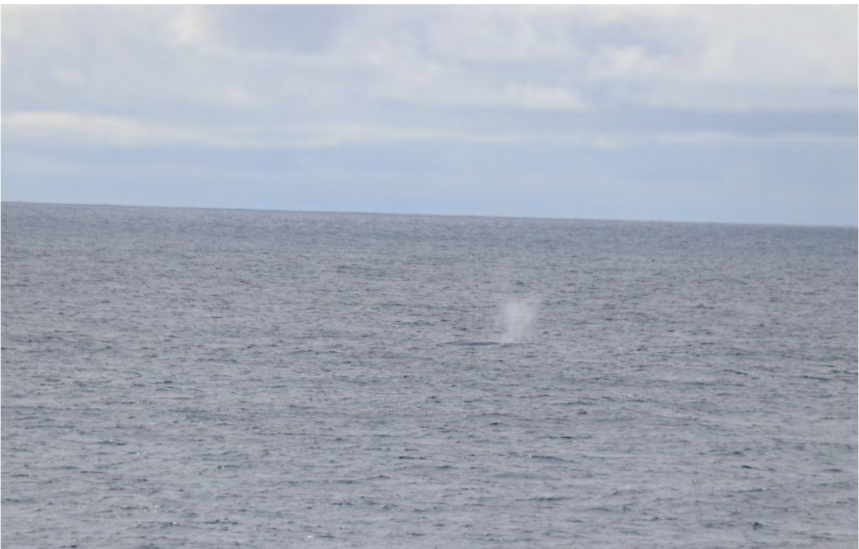
Figure 21: Sei Whale-Visual Detection #127