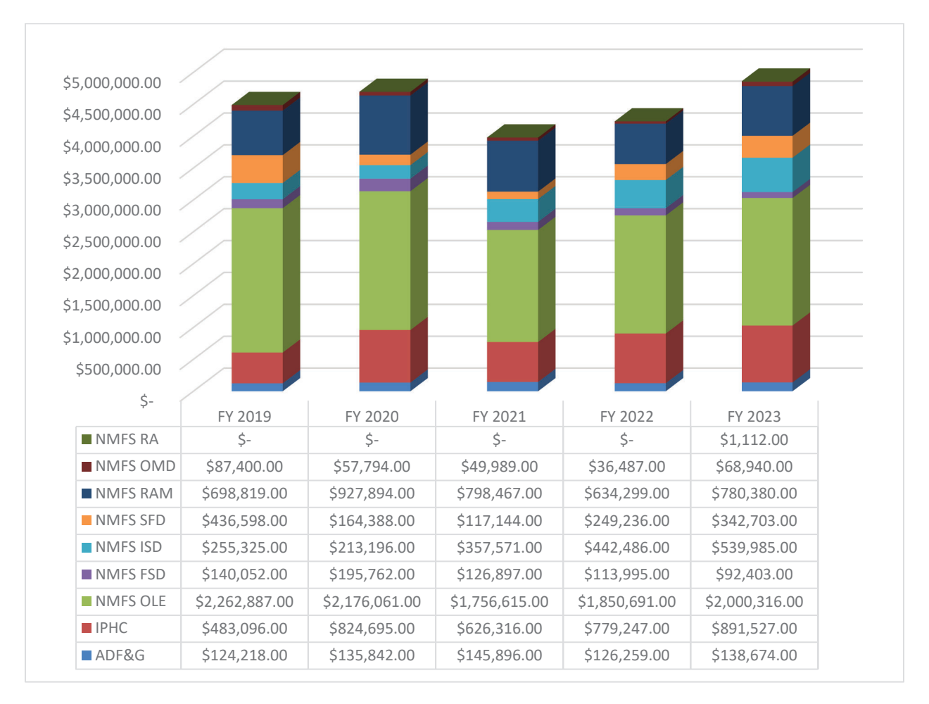
Figure 3. Comparison of IFQ direct program costs for NMFS, IPHC, and ADF&G 2019 – 2023.