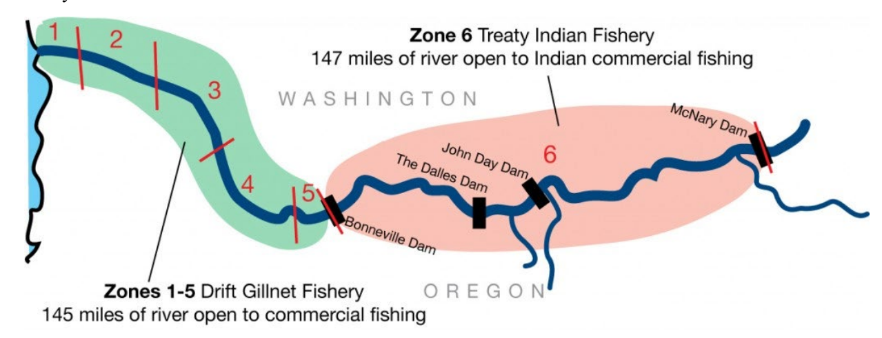
Figure 2. Map of designated fishing zones in the lower Columbia River.