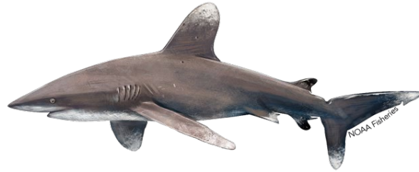
Figure 1. Oceanic Whitetip Shark

On January 30, 2018, after considering the best available scientific and commercial information, we listed the oceanic whitetip shark ( Carcharhinus longimanus ) as a threatened species throughout its range (83 FR 4153). The final rule became effective on March 1, 2018.