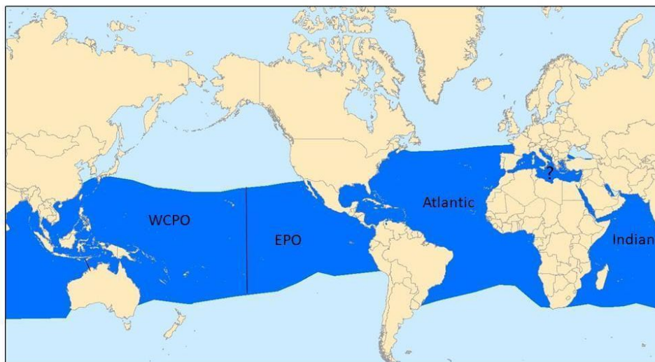
Figure 2. Global range of the oceanic whitetip shark with Management Unit boundaries based on tuna-RFMO convention areas.

Oceanic whitetip sharks exhibit life-history traits and population parameters that differ between the Atlantic Ocean and Pacific Ocean. In the Atlantic Ocean, oceanic whitetip sharks reach sexual maturity at approximately 6-7 years and 180-190 cm total length (TL) (both sexes) (Seki et al. 1998; Lessa et al. 1999), while in the North Pacific Ocean, sharks mature later at ages of 8.5-8.8 years for females and 6.8-8.9 years for males (Joung et al. 2016). Oceanic whitetip sharks also grow slower in the Pacific Ocean.